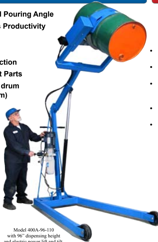
Model 400A-96-110 with 96" dispensing height and electric power lift and tilt.

Though often used for lifting and pouring, the Hydra-Lift Karrier can be used in various ways, such as lifting drums on or off scales, platforms, conveyors or trucks, moving drums to or from storage, charging high tanks and positioning drums of parts for hand access at work stations.