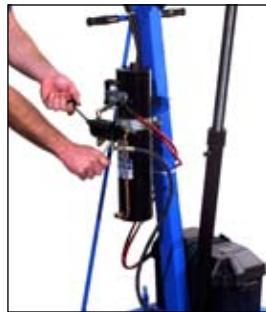
Battery Power Lift and Tilt Option #115

Similar to Option 124 above, except with a second valve controlling the hydraulically driven drum tilt.