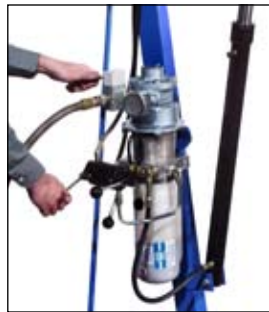
Air Power Lift and Tilt Option #114

Similar to Option 120 above, except with a second valve controlling the hydraulically driven drum tilt.