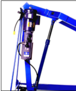
Electric Power Lift Option #120

Use switch to raise the drum. Lower the drum with manual release valve.