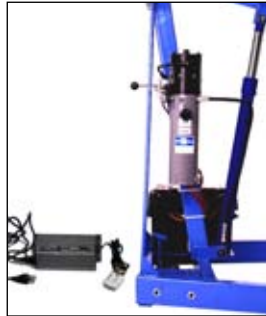
Battery Power Lift Option #125

Use on/off valve to raise the drum. Lower the drum with manual release valve.