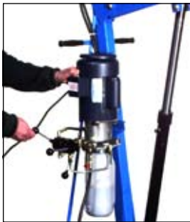
Electric Power Lift & TILT Option #110

Similar to Option 120 above, except with a second valve controlling the hydraulically driven drum tilt.