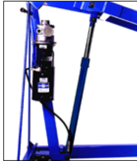
Air Motor Power Lift Option #124

Use switch to raise the drum. Lower the drum with manual release valve.